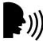
Read or Paraphrase